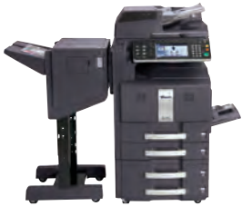
Shown with Optional DSDP, 500 x 2 Tray, and 1,000 Sheet Finisher 48.8 W x 26.8 D x 48.8 H