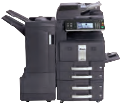
Shown with Optional DSDP, 500 x 2 Tray, and 3,000 Sheet Finisher 50.9 W x 26.8 D x 48.8 H