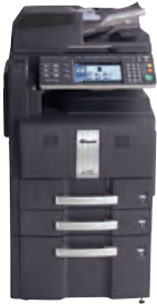
Shown with Optional DSDP and 3,000 Sheet LCT 23.8 W x 26.8 D x 48.8 H