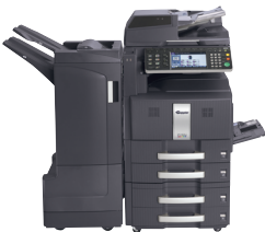
Shown with Optional DSDP, 500 x 2 Tray, and 3,000 Sheet Finisher 50.9" W x 26.8" D x 48.8" H