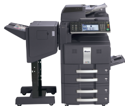
Shown with Optional DSDP, 500 x 2 Tray, and 1,000 Sheet Finisher 48.8" W x 26.8" D x 48.8" H